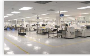
Hanoi, Vietnam Facility