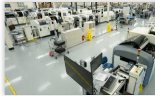
Newark, CA Facility