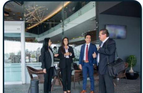
Technical Leadership in Memory & Storage