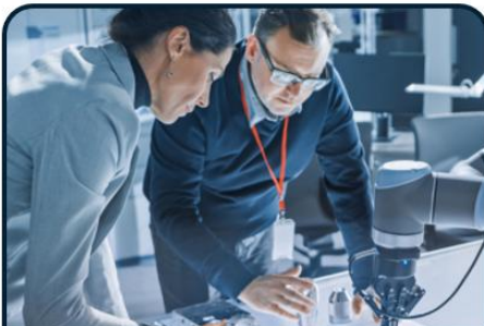
Flexibility & Customization