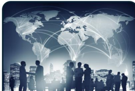
Offshore & Onshore Manufacturing Sites