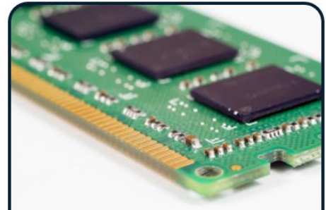
Long-Term & Legacy Product Support